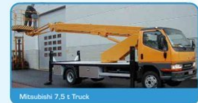
Mitsubishi 7,5 t Truck

XS 240 boom construction can be easily fitted to other applications