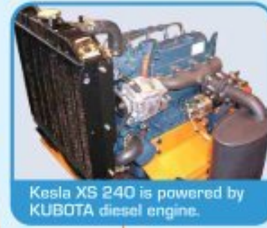
Kesla XS 240 is powered by KUBOTA diesel engine.