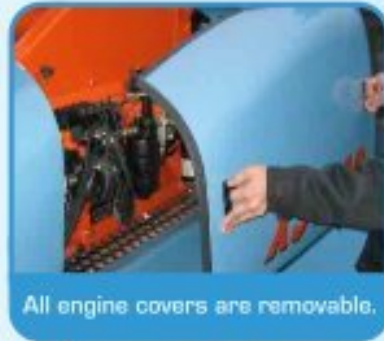
All engine covers are removable.