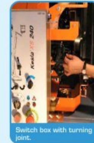
Switch box with turning joint.