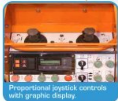
Proportional joystick controls with graphic display.