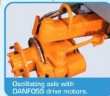
Oscillating axle with DANFOSS drive motors.