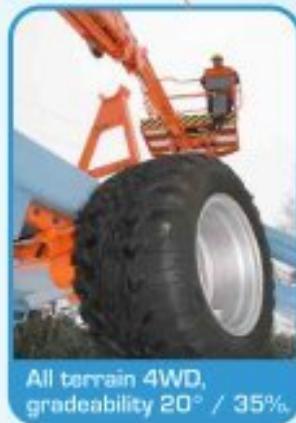
All terrain 4WD, gradeability 20° / 35%.