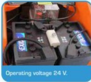
Operating voltage 24 V.