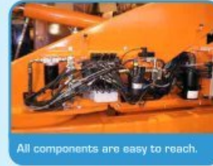
All components are easy to reach.