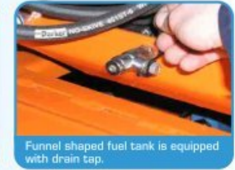
Funnel shaped fuel tank is equipped with drain tap.