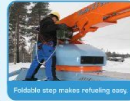
Foldable step makes refueling easy.