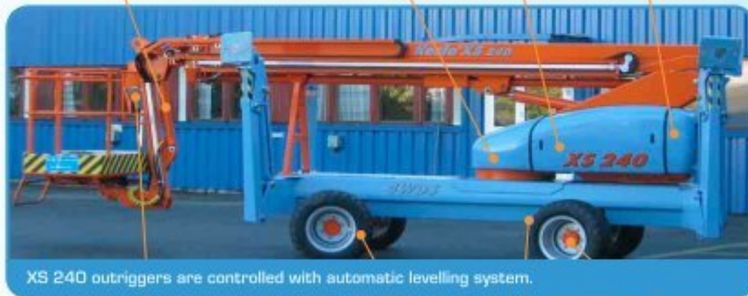
XS 240 outriggers are controlled with automatic levelling system.