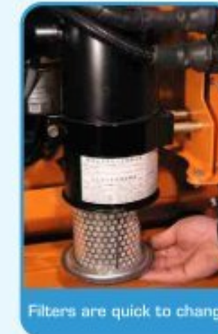
Filters are quick to change.