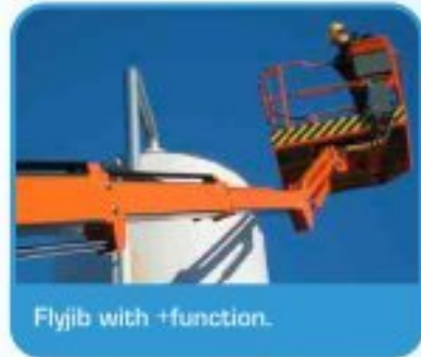
Flyjib with +function.